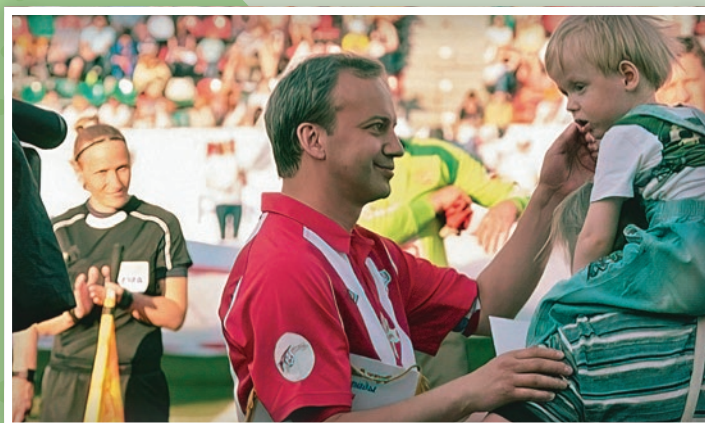
Arkady Dvorkovich, President of the International Chess Federation (FIDE), Co-Chair of the Skolkovo Foundation

The Charitable Foundation was established by the organizers of the All-Russian campaign «Under the flag of Kindness» in order to provide financial support to seriously ill children. Fundraising is an essential part of the football matches «Under the flag of Kindness»: since 2005, financial support has been provided to 6556 seriously ill children in the amount of 371,745,712 rubles thanks to the charity programs of the Foundation.