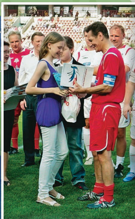
Alexander Zhukov, First Deputy Chairman of the State Duma of the Federal Assembly of the Russian Federation VI, VII, VIII convocation

The Charitable Foundation was established by the organizers of the All-Russian campaign «Under the flag of Kindness» in order to provide financial support to seriously ill children. Fundraising is an essential part of the football matches «Under the flag of Kindness»: since 2005, financial support has been provided to 6556 seriously ill children in the amount of 371,745,712 rubles thanks to the charity programs of the Foundation.